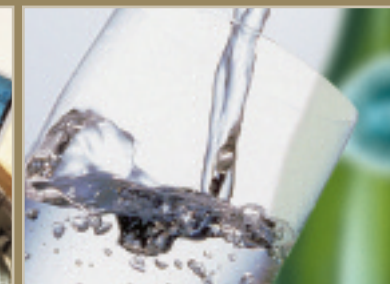
MINI-BAR AND MINERAL WATER