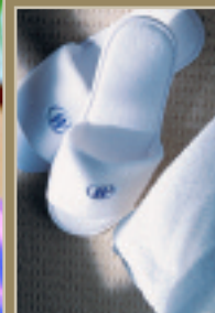
BATHROBE AND SLIPPERS