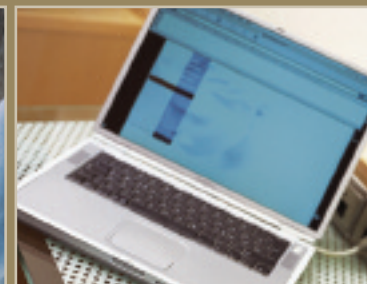
HIGH-SPEED INTERNET ACCESS